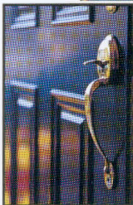
We'll help you open the door to the home of your dreams.